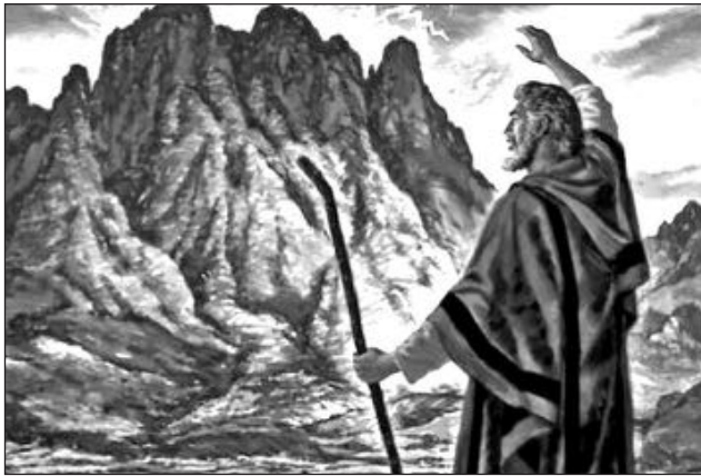
Moses at Mount Sinai