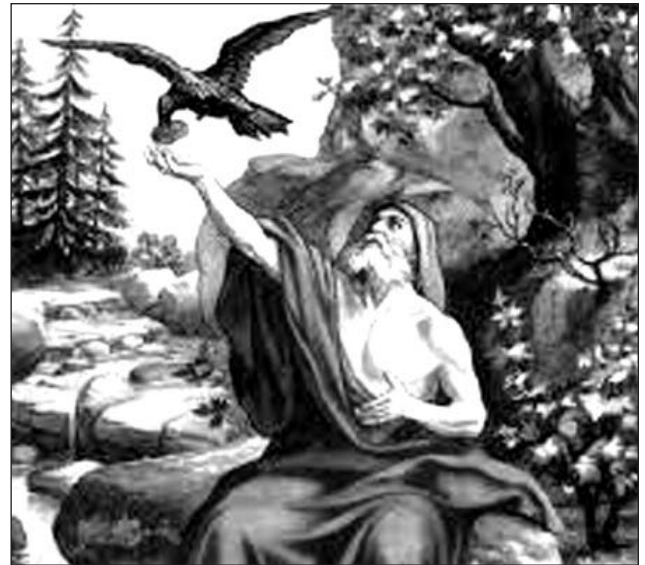
The prophet Elijah

Jeremiah must have felt like Elijah, who stated, “I am the only one of the LORD’s prophets left, but Baal has four hundred and fifty prophets (1 Kings