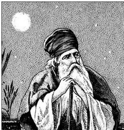
Nicodemus, who came by night

When we accept the call “follow me,” we attempt to imitate our Lord and Master. Paul tells us, “Where the Spirit of the Lord is present, there is freedom. All of us, then, reflect the glory of the Lord with uncovered faces; and that same glory, coming from the Lord, who is the Spirit, transforms us into his likeness in an ever-greater degree of glory” (2 Corinthians 3:17-18 GNB). In Galatians the effect of the Holy Spirit, which is gifted to those who truly commit to following Jesus, produces the following effect on the life of that person. Love, joy, peace, patience, kindness,