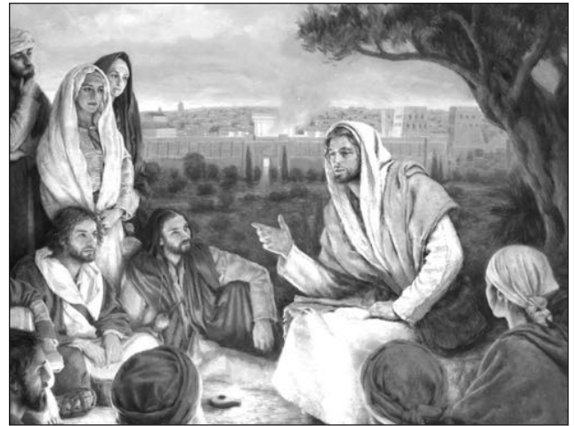
Jesus, our teacher, and our justifier

Later in the chapter, the apostle emphasizes this thought with even greater force, saying, "God is the one who justifies: Who is the one who condemns? Christ Jesus is he who died, yes, rather who was raised, who is at the right hand of God, who also intercedes for us" (Romans 8:33,34). How precious the very thought that from God's standpoint there