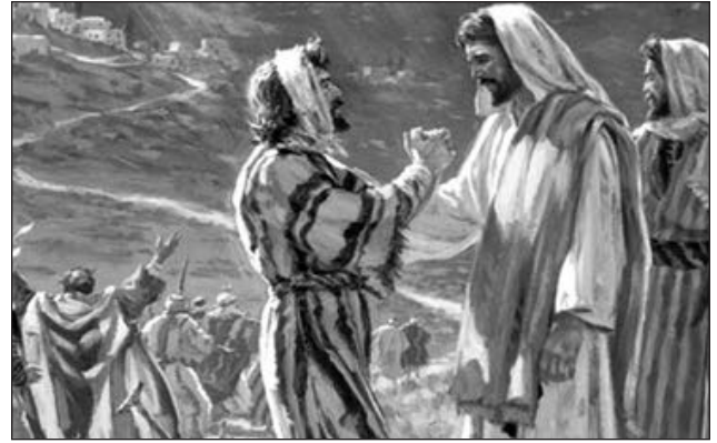
We thank Jesus for his services to us.

Thus, in all these “we overwhelmingly conquer,” gaining the victory through faith in the Great Shepherd, faith in the Good Shepherd, faith in the divine plan, and faith that if we perform obediently our part in that plan, we shall ultimately “dwell in the house of the Lord forever.” Knowing this certain outcome of the “all things” which are working together for our good, we can say with the apostle that we too are “convinced that neither death, nor life, nor angels, nor principalities, nor powers, nor things present, nor