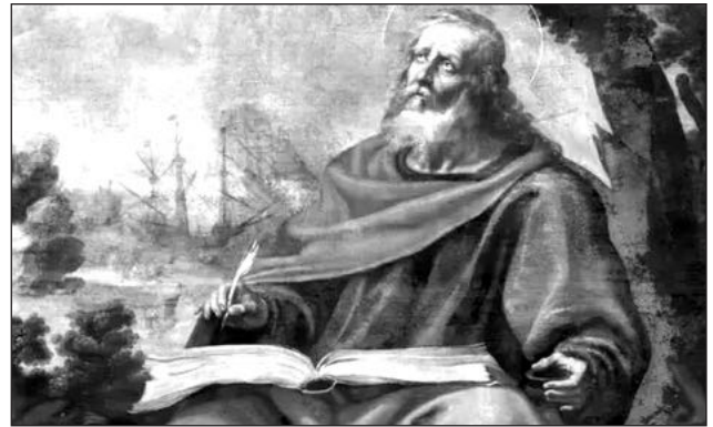
John, the Apostle

(2) "But the Comforter , even the Holy Spirit, whom the Father will send in my name, he shall teach you all things, and bring to your remembrance all that