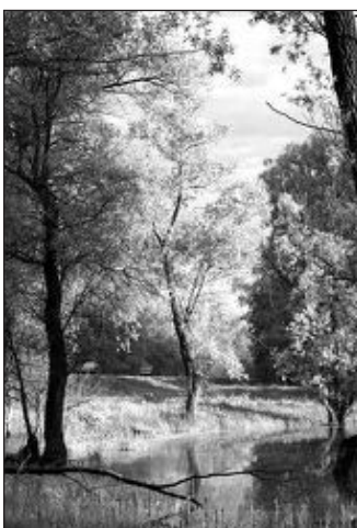
Like trees by a river

The comfort comes from doing of this duty. He that does so will be as a tree planted by the waters , a choice tree, about which great care has been taken to set it in the best soil, so far from being like the heath in the wilderness ; he shall be like a tree that spreads out its roots , and thereby is firmly fixed, spreading them out by the rivers , whence it draws abundance of sap, which denotes both the establishment and the comfort which those have who make God their hope. They are at ease, enjoying a continual security and serenity of mind. A tree thus planted, thus watered, does not see when heat comes , does not sustain any damage from the most scorching heats of summer; it is so well moistened from its roots that it shall be sufficiently guarded against drought.