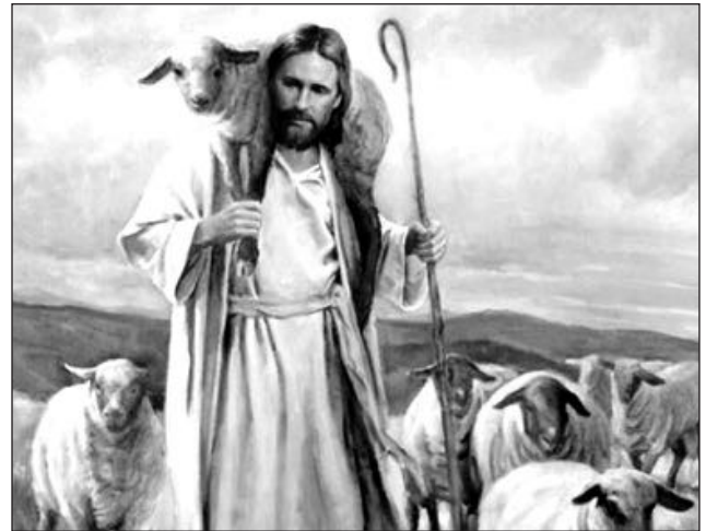
Jesus is our shepherd.

Those of us who, through our consecration and the acceptance of God, have come into Christ, and are walking in accordance with the Holy Spirit by which he