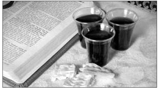
The Memorial emblems represent the blood and body of Jesus.

Therefore, I submit, that what the Apostle Paul was pointing us to in part, was that the purging processes from sin are essential goals to worship and serve God, individually and collectively, with a very sincere and resolute heart — with the internalization of the Truth and its powerful effects for positive change. A heart so committed cannot intelligently associate and have any communion with someone who is out of accord with that spirit of sanctification — that spirit of oneness, that breaks the bread of communion and