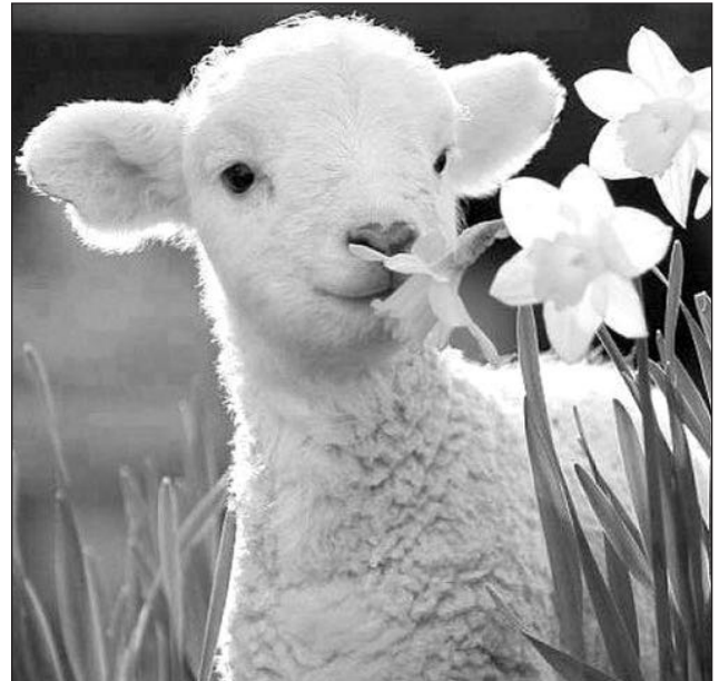
Jesus is our passover lamb, providing the Ransom.

(1) The forgiveness of sins for the HOUSEHOLD OF FAITH, under the Abrahamic Covenant with believers.