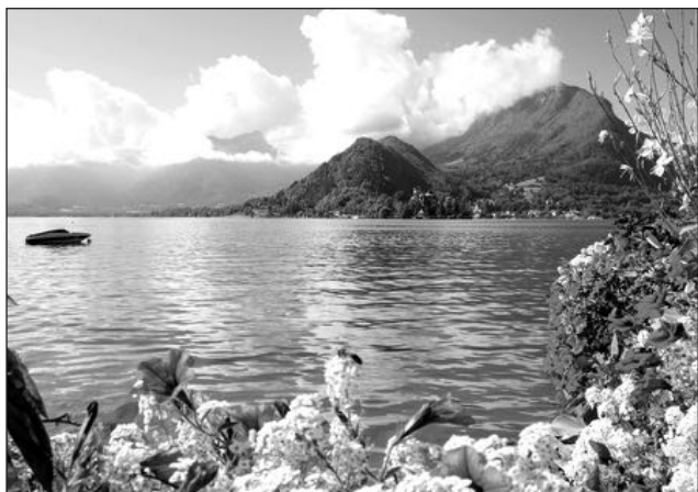
The Millennial Kingdom, brought ty Christ, will be wonderful.

Thus, the sacrifice of Christ, Head and Body, has progressed for over eighteen centuries. We believe that the consummation is near at hand. When the High Priest shall have accepted the last member of His Body, and shall have finished the sacrificing, He will apply, beyond the vail, the blood, His own blood — the blood of His members — on the mercy-seat, on behalf of all the people. Then will be due that which the Lord promised through the Prophet Joel — that He would pour out His "spirit upon all flesh," just as at the completion and offering of the first sacrifice He poured out His "spirit upon His servants and handmaidens" at Pentecost. Who that has spiritual eyesight cannot see this? And if we once saw it and it is now becoming dim to any of us, what is the remedy? All such should go immediately to the great Physician for eye salve. They should haste in fear lest complete blindness and outer darkness overtake them. Fasting, prayer and heart searching we earnestly recommend.