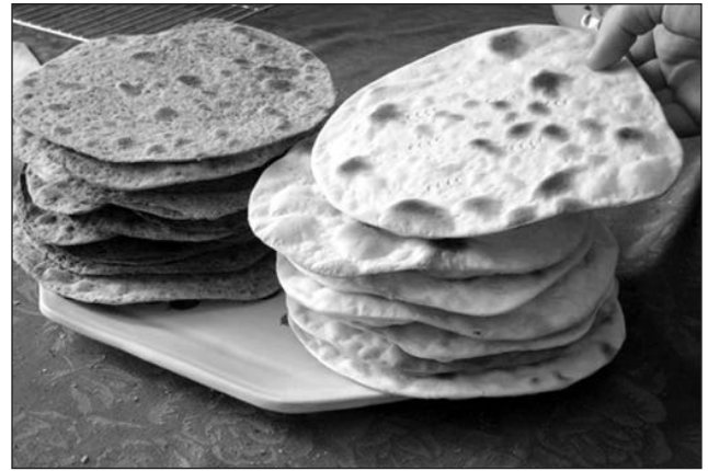
Are we unleavened?

So where did sin originate? How can one go further back than the “mind” of Satan himself for its origin? How could something unrighteous come out of something originally created perfect? And how could sin have gone back further than being conceived in the mind of Satan? Was uncreated pride or perhaps jealousy the first sprout of sin's origin? (Isaiah 14:12-14). Could pride or jealousy be elements of sin that are hiding in our own hearts that need to be thoroughly purged by the sanctifying energy and healing balm of the holy scriptures? Thoroughly purged by holy substance of faith, love, and loyalty in Jehovah God (Hebrews 11:1). A being totally focused on glorifying and pleasing God can hardly fall into a trap of pride, jealousy, or selfishness. Darkness cannot come out of light, unless the light be turned off. “God is light, and in Him is no darkness at all” (1 John 1:5-7).