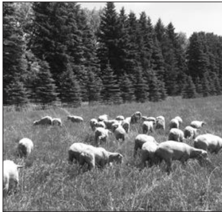
God's sheep are well fed.

The true understanding of the manner and purpose of Christ’s second coming was also totally lost, with the result that his return became associated with what was often thought of as the “crack of doom.” Misconceptions of our Lord’s return included the much feared burning up of the earth and a twenty-four hour judgment day. These are but some examples of the crude notions and weird superstitions which, through the centuries, had replaced the pure doctrines of the Word of God. All of these might very well be classified