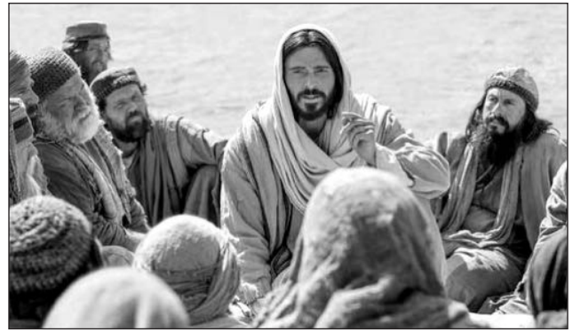
Jesus, our teacher

The world is another enemy of the Lord's sheep. The world holds out its allurements to the sheep to attract their attention, their time, and influences them to leave the luscious green pastures of truth and seek satisfaction elsewhere. There are certain obligations which we all have towards those in the world, time and interest in material things come within the category of what Jesus described as the "care" of this world and "the deceitfulness of riches" (Matthew 13:22). In these and other ways the influences of the world are at enmity with the new creation. Here again the Good