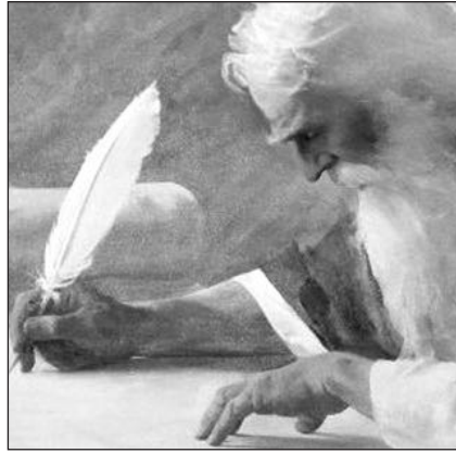
Isaiah the prophet

Isaiah continues, “The foundations of the thresholds trembled at the voice of him who called out, while the temple was filling with smoke. Then I said, “Woe is me, for I am ruined! Because I am a man of unclean lips, And I live among a people of unclean lips; For my eyes have seen the King, the LORD of hosts” (Isaiah 6:4-5 NASB). Isaiah compares the power and holiness of God compared to his, and the people around him, wretched state. How was he able in this state to proclaim the holiness and perfect plan of God?