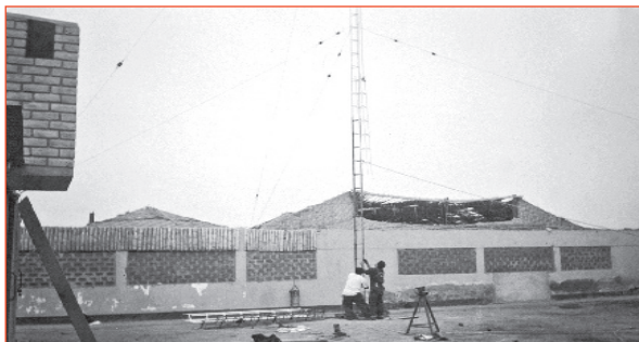
Setting up the Radio Station antenna, 200 feet high.

In order to achieve this increased performance, it was necessary to install a 200-foot radio antenna on the outskirts of the city of Trujillo, Peru. We are thankful to the Peruvian authorities for granting permission to install the antenna. The actual construction was difficult, and was undertaken by hand to save money.