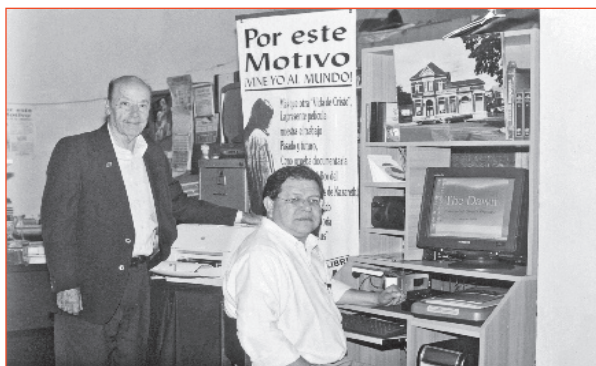
New computer, laser printer, and scanner donated by American brethren.

By the grace of our Heavenly Father, during my pilgrim trips, I have had the pleasure of visiting most of the South and Central American nations. I have found thousands of people in that part of the world hungry for the Truth. For many centuries, they were under the influences of superstition and religious confusion. It has only been in the last 20 to 24 years that varied religious organizations from the United States have set up headquarters in those countries to preach the teachings of their religions.