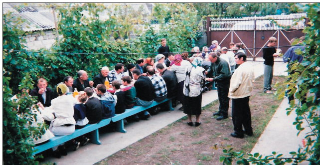
After meeting lunch in Piatra Alba

The warm fellowship and discussion continued outside of the house where tables were quietly set up. Lunch for everyone was a beautiful temporal and spiritual feast.