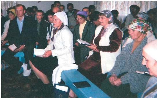
Meeting of brethren from Piatra Alba and Tinterine, Moldova in home

That night we stayed at the home of brethren with whom, after much visiting and discussion of the Scriptures, we retired at 2 A.M. Early the next morning, 90 friends came and attended a meeting in this home, filling every room. The lesson was the test of the faith and trials of the prophets of old, and what they went through in their lifetime. What a lesson for us of their endurance and courage! At this meeting, we had a young sister translate into their language. As usual, many good questions were asked afterward, and discussion continued as to how these faithful prophets might relay messages to mankind in the kingdom, what kind of rule would be in effect then, and other questions.