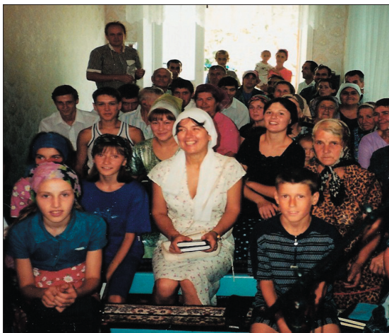
Meeting of young people in Moldova

Early the next morning we started our long journey back to Moldova, stopping at a brother's house to pick up the remainder of our luggage. We journeyed from there to the southern part of Moldova where there was one more class meeting and a great feast. They had prepared homegrown fresh pork which they barbecued for everyone attending.