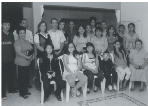
The Bible Students Ecclesia at Medellin, Colombia, South America (Some brethren are not shown due to employment obligations)