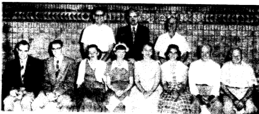
Front row: brethren who were immersed. Back row: those who served .