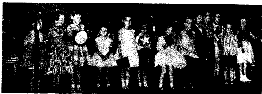
The Juvenile Bible Class reports on what they learned during the convention.