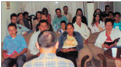
Bible Students Ecclesia Medallin, Columbia, So. America

Since that time, we have had our study meetings two times a week with two groups of brethren that