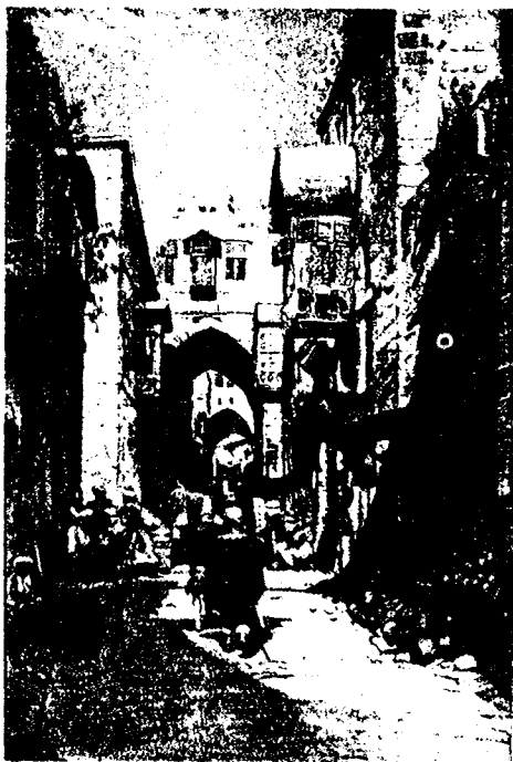
A Street in Jerusalem

Thus, at the time of Jesus' first advent, Jerusalem was under the rulership of the Roman Empire, although the Jews were allowed a great deal of religious liberty. The Roman authorities did not interfere with their worship as long as they did not attempt to interfere with the authority of their civil rulers. Because the Jewish religious rulers of Jerusalem and Israel at that time desired