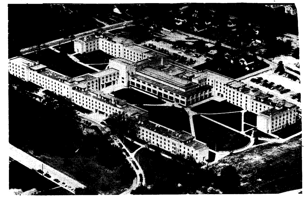
ABOVE—Men's Quadrangle where convention delegates will be housed. BELOW—Lounge in Men's Quadrangle.