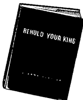
Cloth Bound—50 cents

Deals with the prophecies pertaining to the manner, time, and purpose of our Lord's return and second presence. One hundred and fifty-two pages.