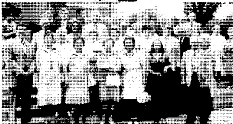
HAPPY GROUPS OF FRIENDS!