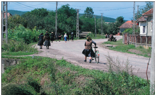
Sisters Leaving Meeting in Romanian Village

would come through and say, “We want your house,” and would move them into the towns where they could better keep an eye on them. These were very hard times for them, but their faith was strong and they found ways to meet secretly in the forest or other areas where they could have fellowship and share pages of Truth material.