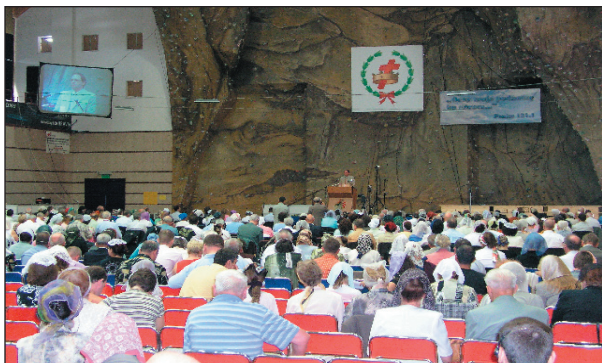
Convention Hall with Rock Climbing Wall

in the audience who, using FM radios with ear-phones, tuned in to the broadcast in their own language. Sleeping accommodations were in several different locations near the Sports Hall. Buses were provided to shuttle brethren to and from the Sports Hall, and meals were served family style in a large facility across the street.