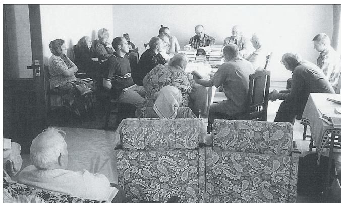
Meeting in village in Ukraine