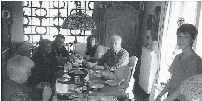
Ruthmann Home, Germany

say, have left the precious fellowship due to a conflict of ideas, but we all felt this judgment is in God's hands.