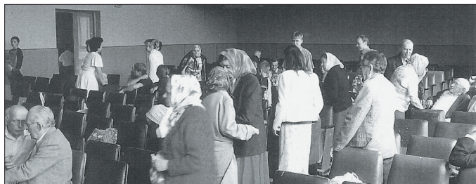
Gathering for meeting in Lvov, Ukraine