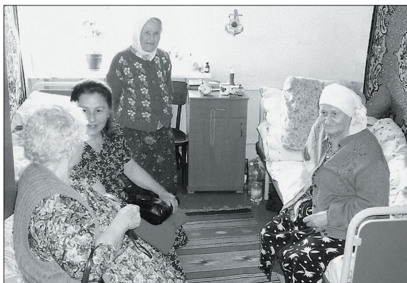
Visit with elderly sister in Ukraine