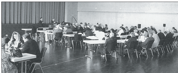
Korbach, Germany Convention

In the evening, there was an informal meeting, with the reading of scriptures, singing of hymns, and testimonies. One of the cherished memories was hearing about a dear brother who had been taken to a concentration camp during World War II. This dear brother, in some way, had heard that another brother was to be sent to the camp. So this dear one decided to hum a favorite hymn, and perhaps by so doing, he would find the other brother.